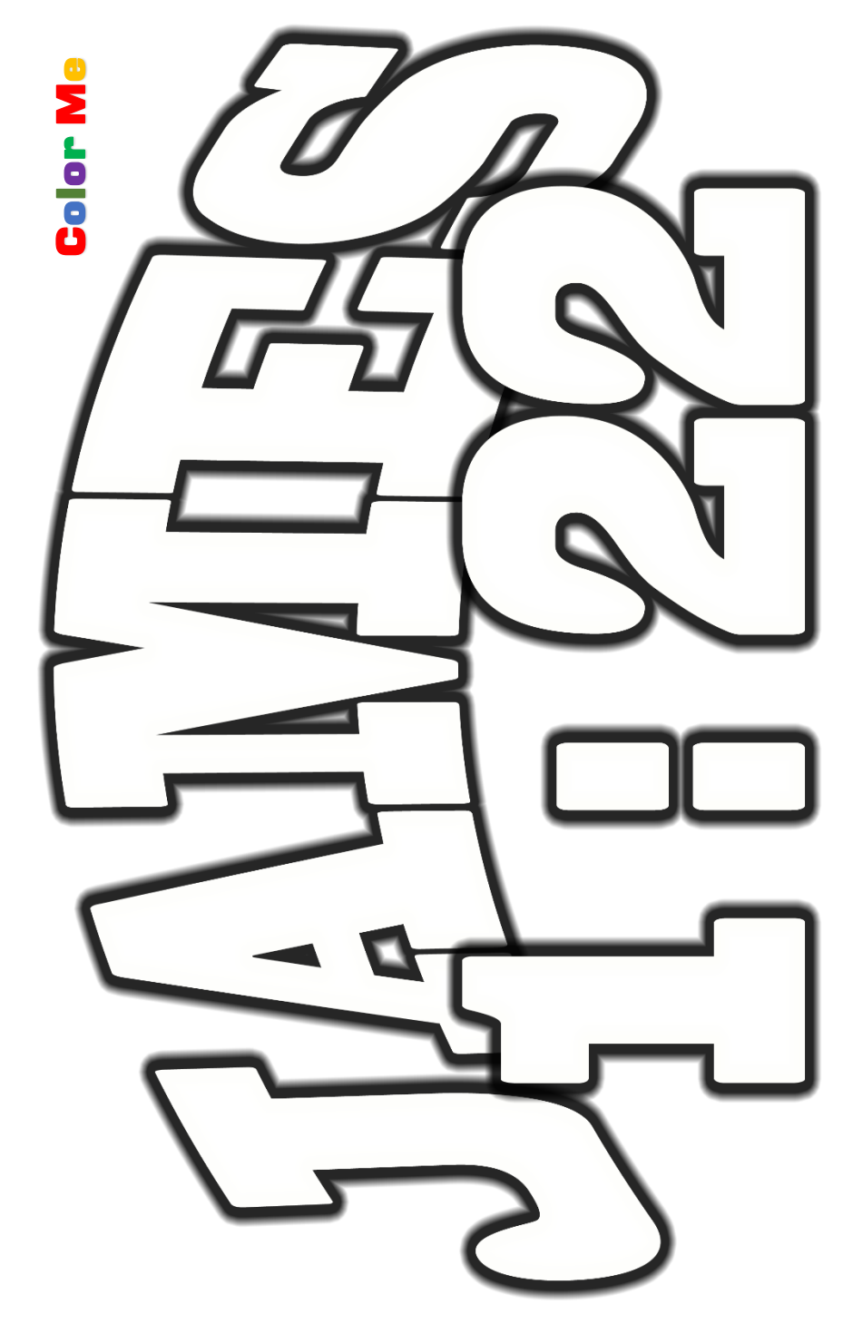
Say it - Script it - Sing it - Share it