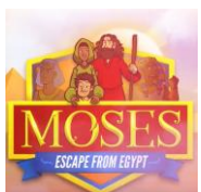
Escape from Egypt