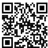
The Burning Bush