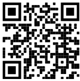
Joseph and his Coat