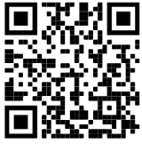
Jacob and Rachel