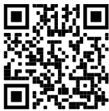
Joseph in Prison