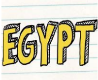
Joseph in Potiphar