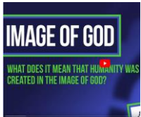
Image of God